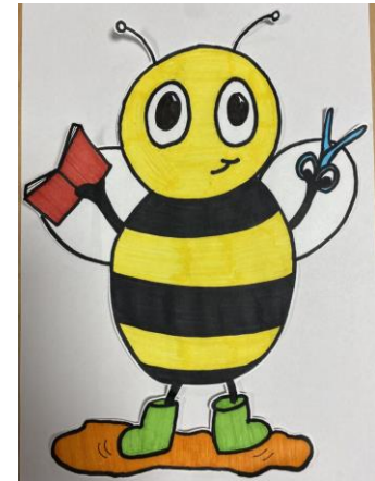
Can do Bee

Playing and exploring - children investigate and experience things, and ‘have a go’